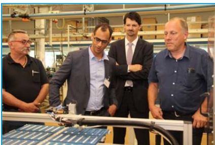
Visiting the coil filament department